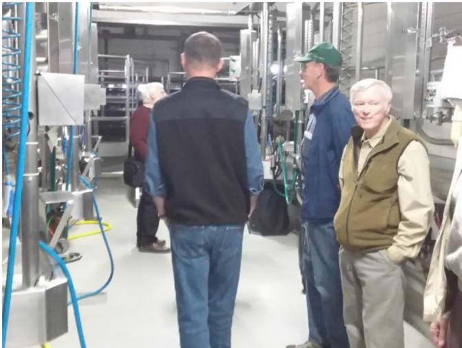
Here some of the Club members are examining the equipment in the dairy barns.

We took a bus from Edmonton to the Colony. One amusing aside is that some of the children enjoyed taking a bus ride while we were touring. The tour ended with a visit to the meat shop, where many of us purchased some of the colony's meat products. All in all, thanks to our guide, it was one our better tours.