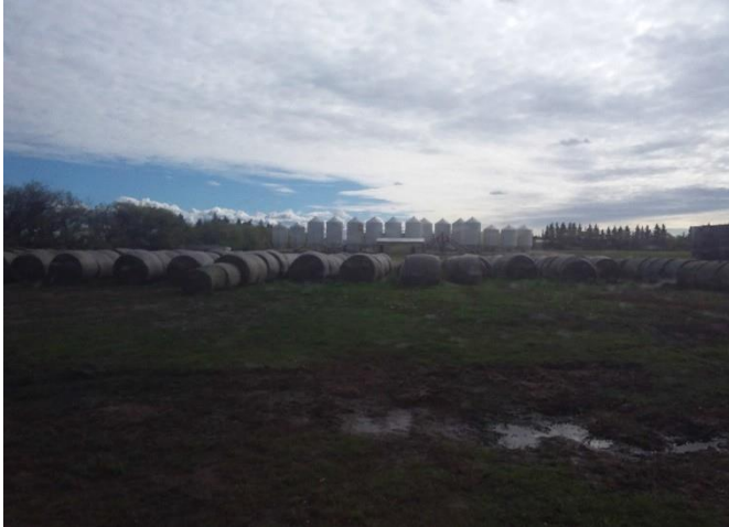
This is a picture of one of the storage facilities and some of the roles of hay.