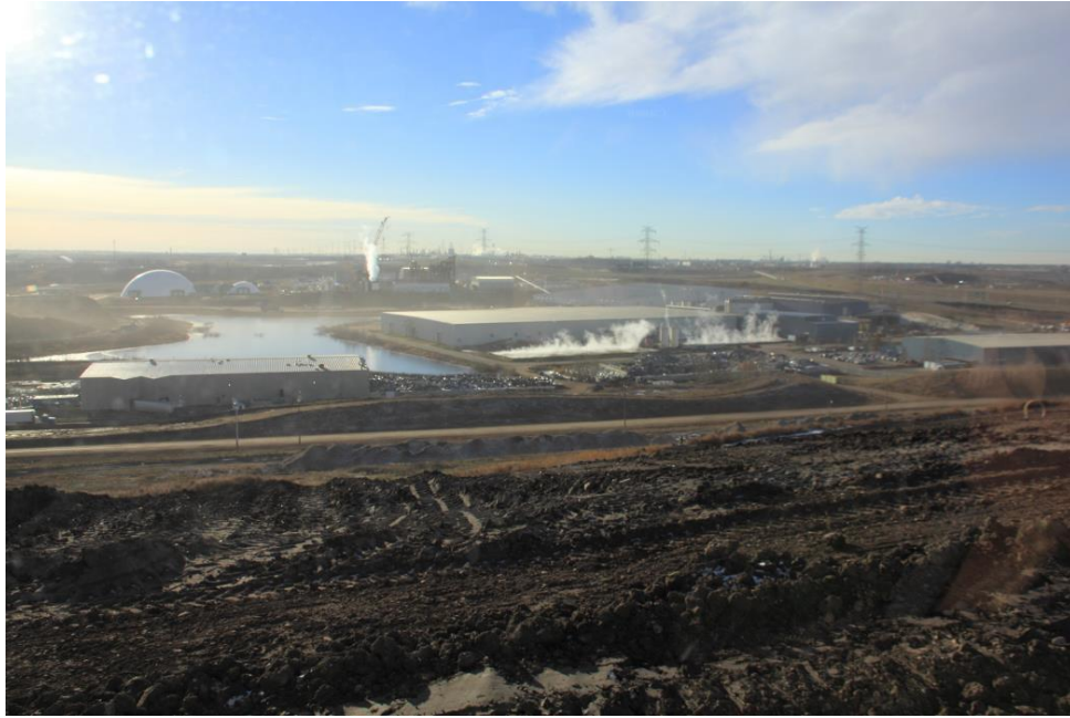
At the conclusion of the tour, Neil drove the mini bus to the top of the Clover Bar Landfill for an interesting view of Edmonton and the river valley.